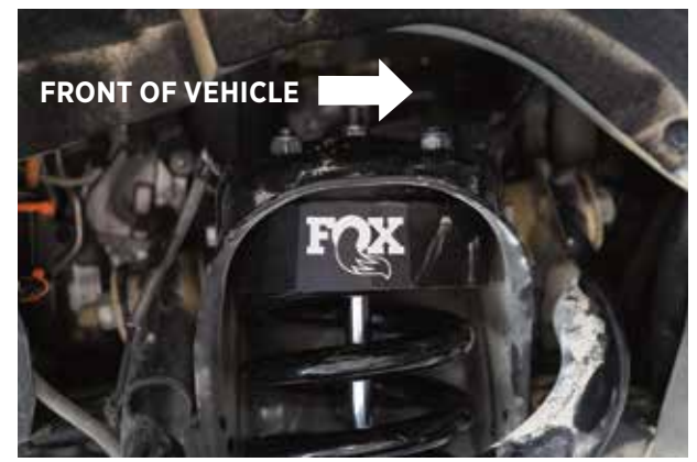
Fig. 6: The FOX logo on the logo ring and shock body faces outboard

10. Once the shock is oriented, torque the top hat nuts to 24 ft-lbs. Torque the lower mount bolt to OEM specification.