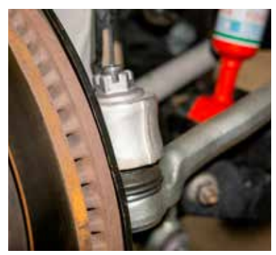
Fig. 1: Tie rod end.

6. Take off the nut connecting the upper control arm (UCA) to the upright. Tap the ball joint stem with a hammer to break it free. Proceed with caution, the UCA has spring tension (Fig. 3). Detach the UCAs on both sides of the vehicle.