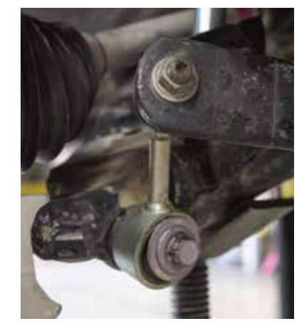
Fig. 9: Sway bar end link.