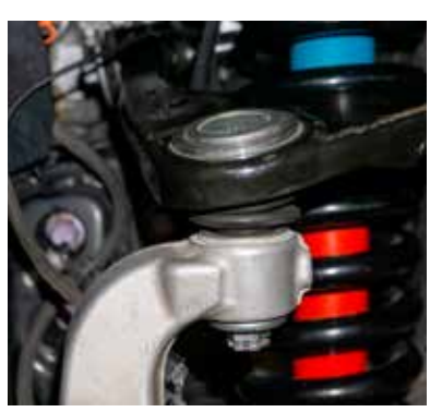
Fig. 3: Disconnect UCA.