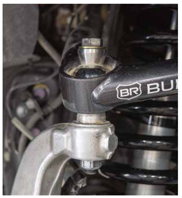
Fig. 7: Reattach UCA to the upright.

12. Reattach the UCA to the upright with the ball joint bolt and torque to OEM specification or the UCA manufacturer's specs (Fig. 7).