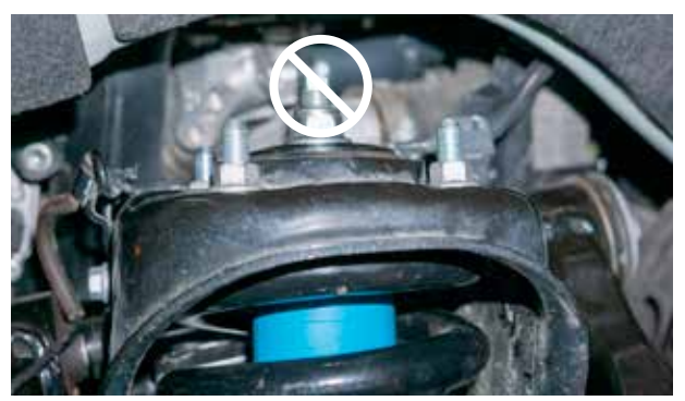
Fig. 4: Remove the four top hat nuts.

NOTICE: Do not discard any OEM bolts, many are reused with the new FOX shock assembly.