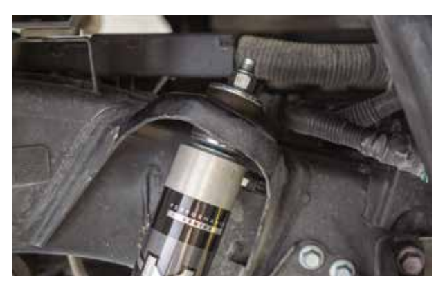
Fig. 12: Install the stem top nut (passenger side shown).

6. Torque the lower bolt to OEM specification (Fig. 13). Tighten the stem top nut until there are 3-4 threads showing above the nut.