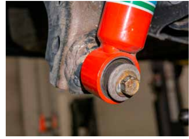
Fig. 11: Remove lower shock mount bolt.