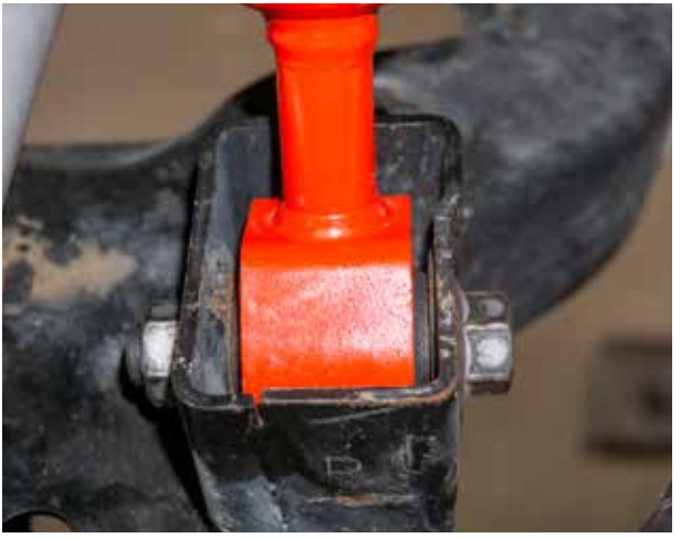
Fig. 5: Remove the bolt from the lower control arm.