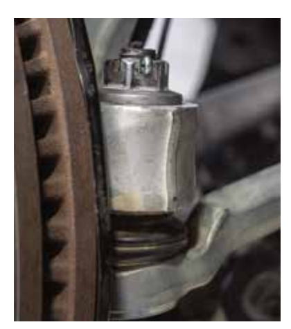
Fig. 8: Tie rod end.

13. Reinstall the tie rod end (Fig. 8) and sway bar end link (Fig. 9). Torque all hardware to OEM specification. Secure the tie rod end castle nut with a new cotter pin.