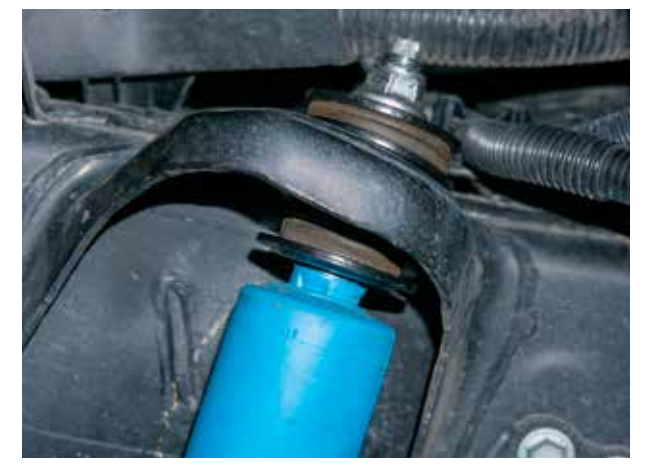
Fig. 10: Remove stem top nut.

3. Remove the stem top nut and lower shock mount bolt (Fig 10 & 11).