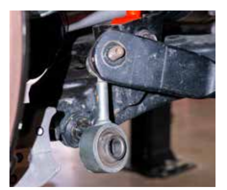
Fig. 2: Sway bar end link.