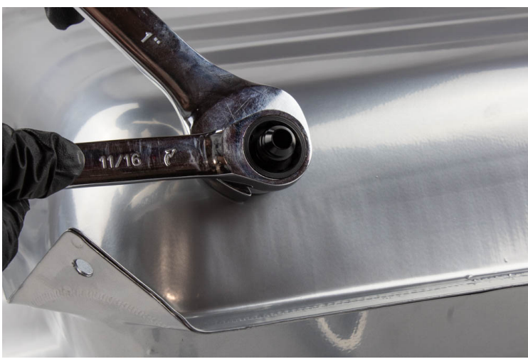
Install ORB fitting.