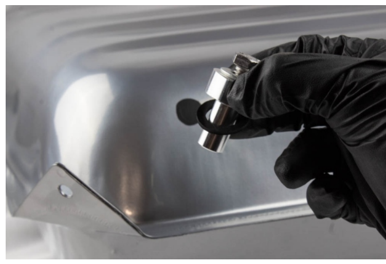
Insert fitting with gasket, screw and washer.

IMPORTANT NOTE: The fuel tank on your vehicle must be vented to avoid pressure building up inside the tank. Do not attempt to install and operate an EFI system without a properly vented fuel tank.