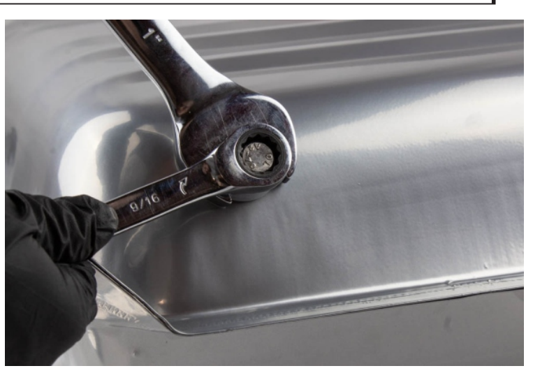
Twist bolt to collapse and set bung.