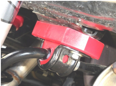
Image 2. Rear Sway Bar Spacer and Bushing