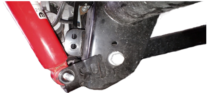
Image 3. New and Existing Hole in Sway Bar Mounting Tab