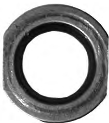
Figure 2 - #1 Head Bolt Washer