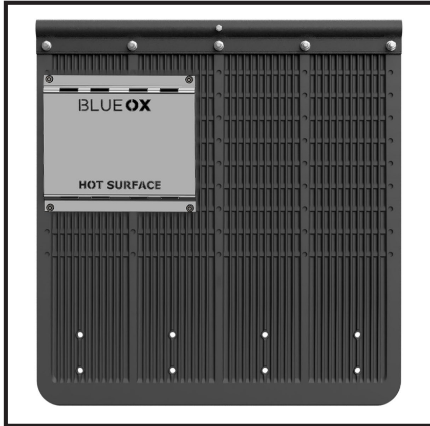
Mud Flap Heat Shield 1.0 mm thick stainless steel

The Heat Shield is an accessory item that protects your mud flap from high exhaust temperatures. It allows for closer installation of the Mud Flap System to your tail pipe(s) by providing heat disbursement of hot exhaust gases.