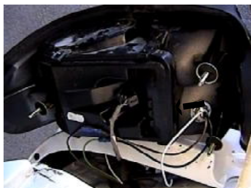
Location for the BX8869 on the passenger's side.