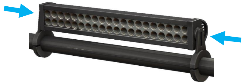
Figure 2: Bolting on Light Bar (Light Bar Not Included)