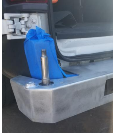
Figure 3. Tape applied to plastic corner pieces to prevent scratching. The swing arm has been removed and door is open to clearly show the location of the tape, although THIS IS NOT THE CONFIGURATION IN WHICH YOU SHOULD INSTALL YOUR ALUMINESS BUMPER.