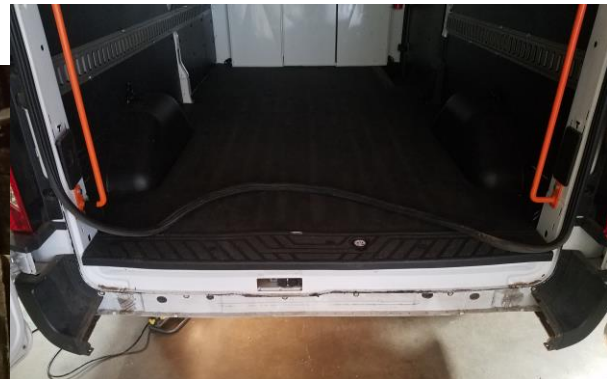
Figure 4. Picture of your vehicle after stock bumper removal.

Note: You may have a backup beeper speaker held in place by these bolts. You can discard the bolts, but hold onto the speaker as you will hold it in place using the replacement bolts provided in this hardware kit.