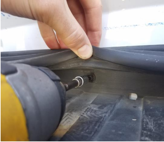
Figure 1. Removal of torx head fasteners on plastic bumper cover.