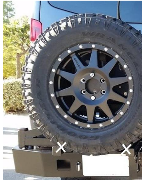
Figure 5. Rest tire on both support arms (before tightening the lugs or U-bolts down). If your tire is "floating" above these support arms, you may damage your swing arm while driving.