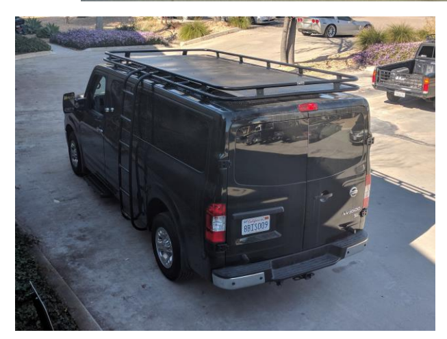
Page 3 of 5