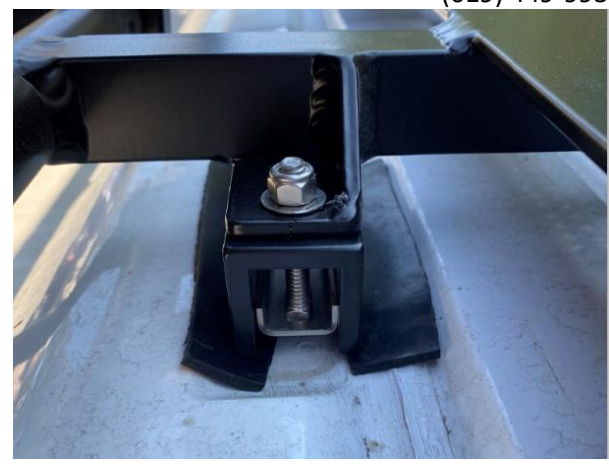
Figure 1: Promaster Roof Rack Mounting Installation