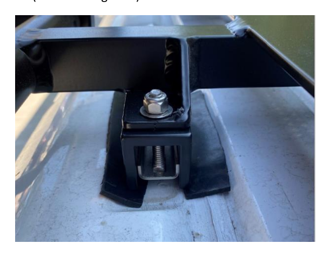
Figure 1: Promaster Roof Rack Mounting Installation