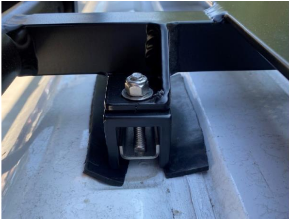
Figure 1: Promaster Roof Rack Mounting Installation