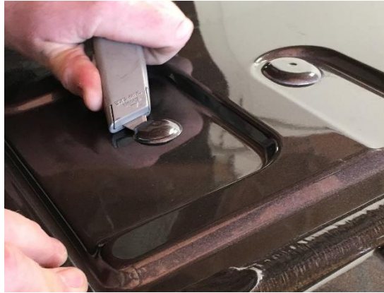
Figure 1: Factory Plug