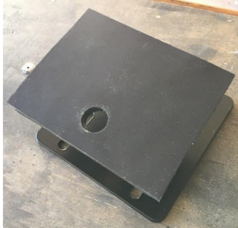
Figure 2: Rubber Pad