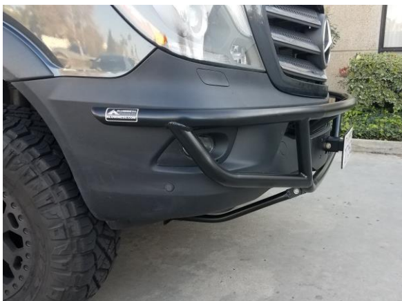
Figure 2. Two support bars underneath the light bar assembly.