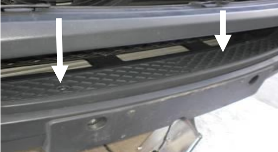
Figure 1. Arrows indicating location of torx-bolts on the front step of the bumper.