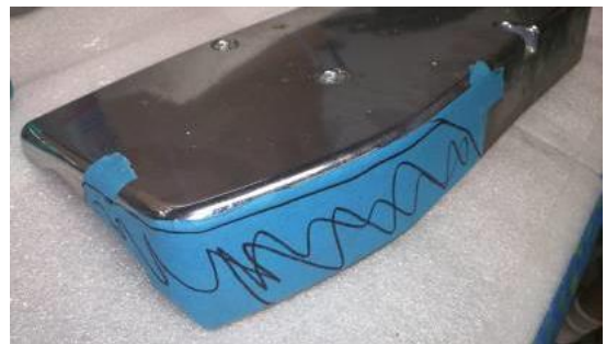
Figure 3. Sharpie marks indicating cutting zone for license plate holder and pipe clearance ( NOTE: Your fitment and trimming may be different than shown in the picture).