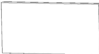
Pinch Weld Extension Plate 3" x 15"