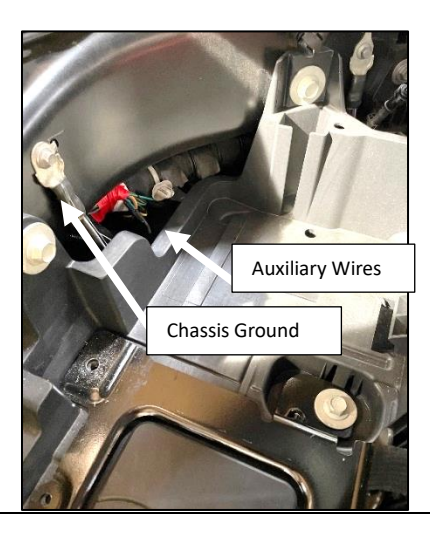
Step 10: Separate the auxiliary wires. Locate the desired auxiliary wire, take the splice connector on the wiring harness, place over the auxiliary wire. Using pliers, force the connector shut. Aux 2-4 can be used.