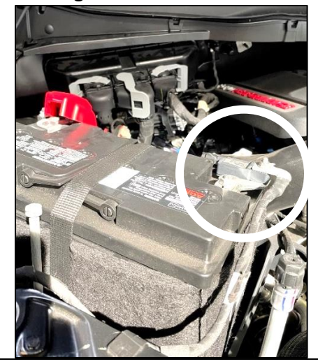
Step 1: Using a 10mm socket, remove the negative cable from the battery.