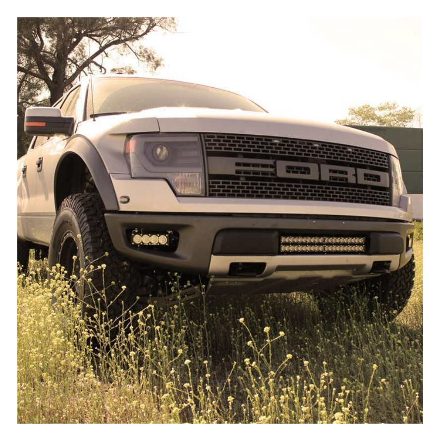
PN: 44-7550 Installation Manual

Baia Designs • 185 Bosstick Blvd. • San Marcos • CA • 92069