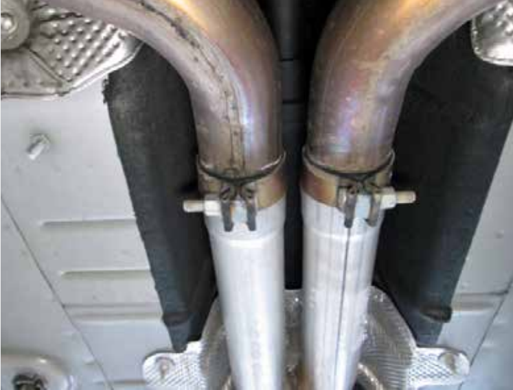
Using 15mm socket disconnect and remove factory head pipes.