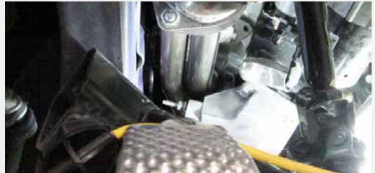
Install BBK headers using supplied hardware and gasket with 10 and 13 mm sockets/wrenches. Re-install motor mount and steering shaft.