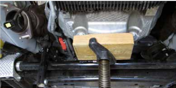
Safely support engine for removal and install motor mounts.