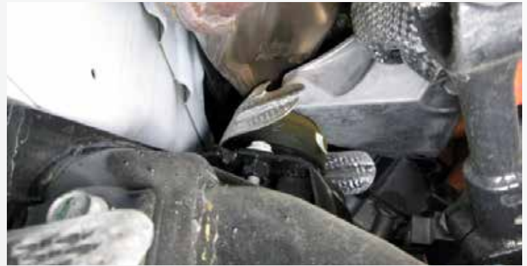
Start removing the 18mm nuts on motor mount at frame then remove 15mm bolts attached to from motor mount to engine and remove. At this time raise engine at least 1 inch for extra room. Then with 10mm socket/wrenches remove factory heat shield and manifold. Make sure at this time to check for any carbon build up on cylinder head and clean for flat sealing surface.