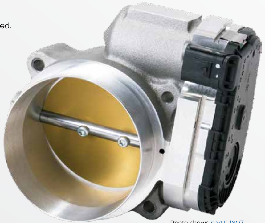
Photo shows part# 1807 - spacer NOT required or supplied with part# 1806

This part will only fit 2015-2017 models - see part# 1940/1941 for 2018 and up.